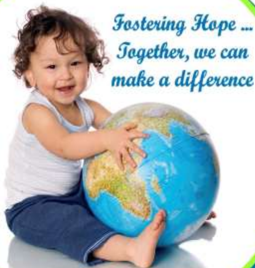
IFCO 2011 World Conference

http://www.ifco2011.com 🍁 email to info@ifco2011.com